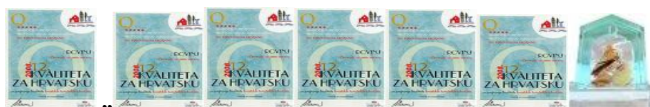
Turistički evijet kvaliteta za hrvatsku „2005.,2006.,2007.,2008.,2009.,2010.,2011..2018. „Tourist flower" for the best small hotel in Croatia